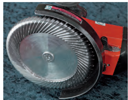
Frontal view of an angle grinder with a milling disc