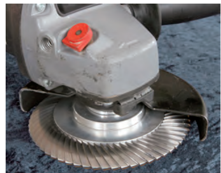
Rear view of an angle grinder with a weld root opener

For effective leveling of welds a milling slide is available which provides a constantly high surface quality due to the adjustable distance.