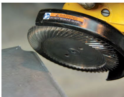
Making a bevel with a milling ring

The milling rings are used for bevelling, smoothing welds and general scrubbing, while the double-sided milling disc is used to open butt- and fillet welds. Especially with aluminium there is no smearing of the material, thereby welding defects are visible immediately. The workpiece remains largely cold and residuals of abrasives are avoided. Thus, the weld quality improves significantly. As residues remain solely chips, work safety is improved and explosion hazards from aluminium dust are avoided.