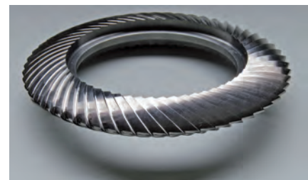
Profile of a double-sided milling ring 116 mm for aluminum

Our standard product range is designed for aluminum and if you need milling rings for other materials please contact us.