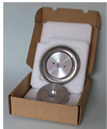
Milling ring set: Consisting of the milling ring, the reusable transport box, the base support and the retainer nut

The base support GTG has a bore diameter of 22.23 mm (7/8") and can be used i. e. with turbo grinders GTG21/25 from Atlas Copco without an additional mounting flange.