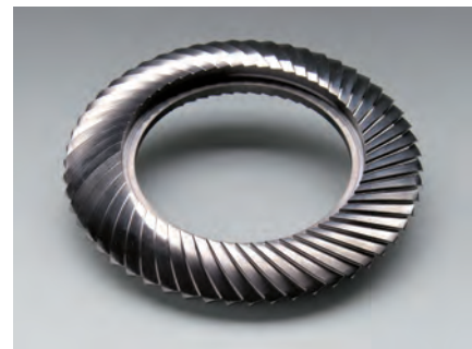
Weld root opener 116 mm for aluminum