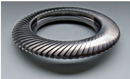
Profile of a 116 mm milling ring

These are available in diameters of 70, 116 and 125 mm and are used for bevelling, leveling of welds and general scrubbing. Suitable materials are all non-ferrous metals, carbon/fiberglass, plastics and wood.