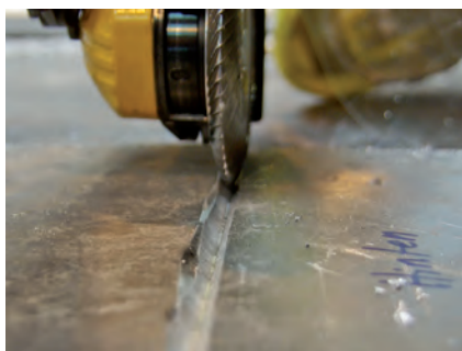
Milling a root gap by using the weld root opener

The removal rate is significantly increased, grinding dust disappears and it does not retain any abrasive residues in the material. The life of a milling ring approximately corresponds to the use of 5,000 conventional grinding discs. Just the resulting savings from disk changing amortize the tool several times. The increase in efficiency and the savings in abrasives cut costs by orders of magnitude.