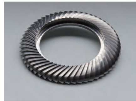
Milling ring 116 mm for aluminum